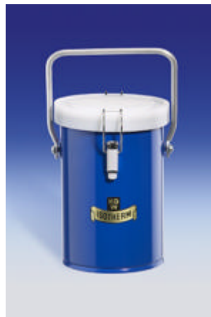
Dewar flask 26 B