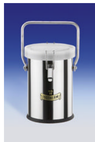
Dewar flask 26 B-E