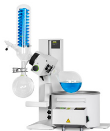
Rotavapor® R-100 Economical evaporation