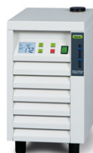
Recirculating Chiller F-100 / F-105 The easy way of cooling