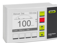
Interface I-100 Economical vacuum regulation