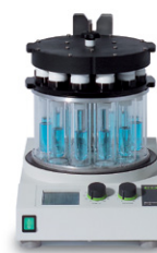
Multivapor™ P-6 / P-12 Efficient evaporation for multiple samples