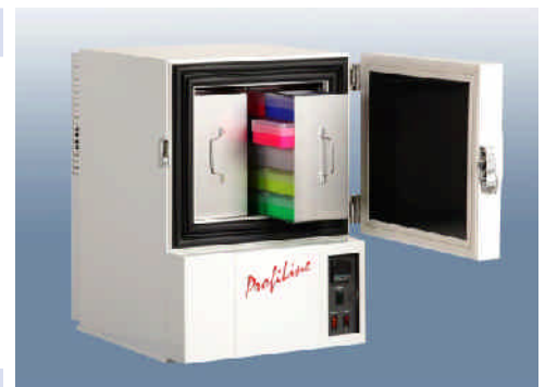
ProfiLine Pegasus PLPE 0486 (With accessories Inventory Systems. See sep. brochure.)