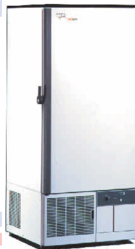
ProfiLine PLECU 51865