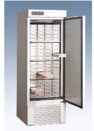
LabMed LM 6025WN