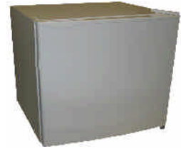
LabMed LM 05..WN