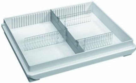
The longitudinal and cross dividers within the drawers are individually adjustable