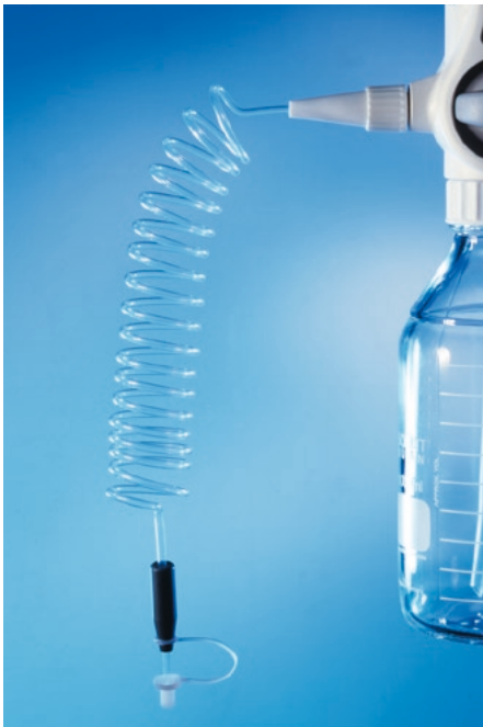
Complete dispensing system for professional applications