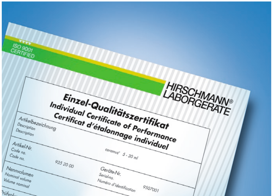
Series design: individual certificate of quality instead of a batch certificate

ceramus® HF is ideal for dispensing operations involving extremely aggressive media. Piston and cylinder are manufactured from maximum-purity aluminium oxide ceramic, valve seats and balls are ceramic and the valve springs are made of platinum/iridium. The volume can be varied between 2 ml and 10 ml.