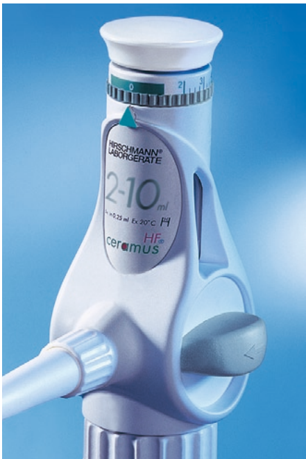
For hydrofluoric acid and other media

ejector units). This allows the realisation of individually-adapted working procedures to suit practical requirements.