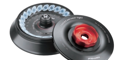
● FA-45-24-11-HS High-speed rotor*** for 24 x 1.5/2.0 ml tubes