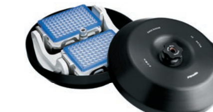
● A-2-MTP Swing-bucket rotor for MTP and PCR plates