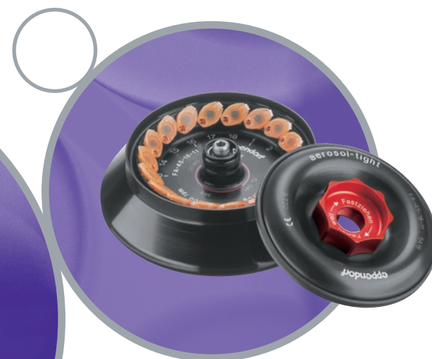
● FA-45-18-11 Rotor (aerosol-tight) for 1.5/2.0 ml tubes