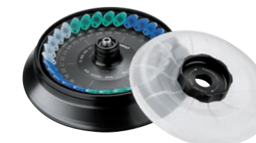
● F-45-30-11 Rotor** for 30 x 1.5/2.0 ml tubes