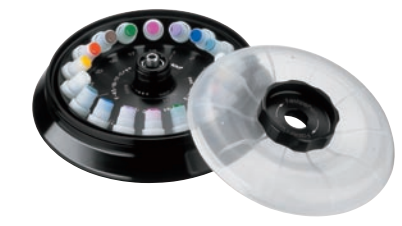
● F-45-18-17-Cryo Rotor for Cryotubes®