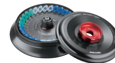
● FA-45-30-11 Standard rotor** for 30 x 1.5/2.0 ml tubes