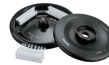
● F-45-64-5-PCR PCR strip rotor for up to 64 x 0.2 ml PCR tubes