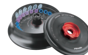
● FA-45-24-11-Kit Rotor* for 24 x open 1.5/2.0 ml micro test tubes, e.g. spin columns