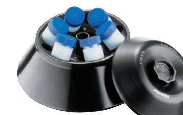
● F-35-6-30 Rotor for 6 x 15/50 ml Falcon® tubes