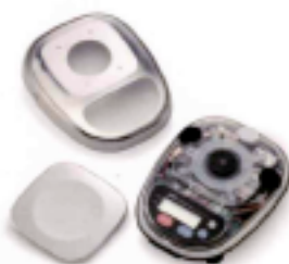
Fully Washdown, Stainless Steel Construction