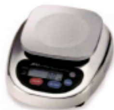
HL-WP Small Pan