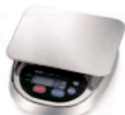
HL-WP Large Pan